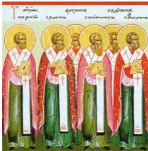
Apostles of the Seventy: Erastus, Olympas, Herodion, Sosipater, Quartus, and Tertius